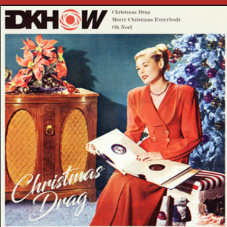
ALBUM ART COURTESY OF SPOTIFY