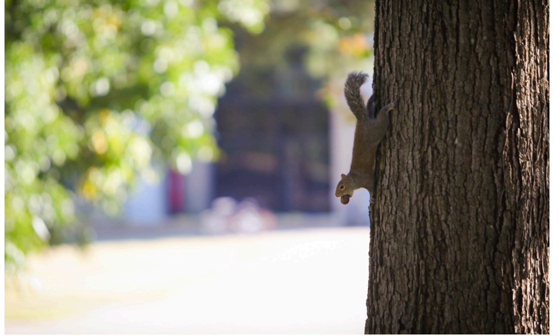
One of the many squirrels on campus, carrying a nut in its mouth while climbing down a tree.