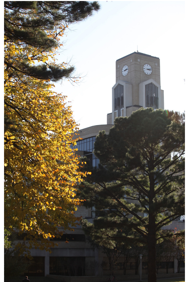
While the trees will not stay colorful and cluttered for long, they currently provide a lovely view when walking to and from class.