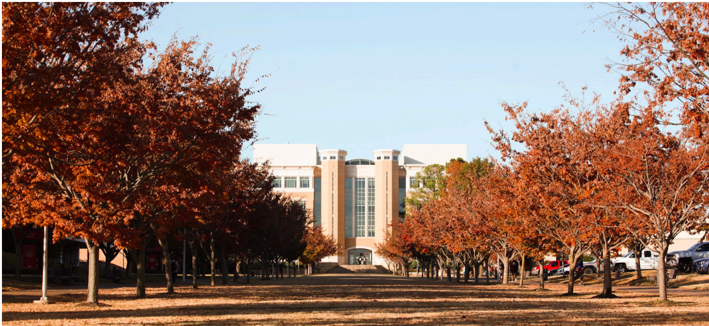
The long rows of trees outside the Humanities and Social Sciences building provide a bright and colorful display on campus.