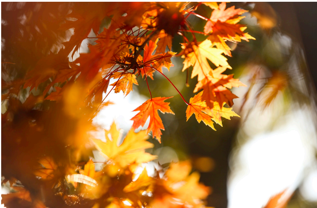
The many trees of varying colors are a welcome sight. This particular tree is outside the Communication and Education building.