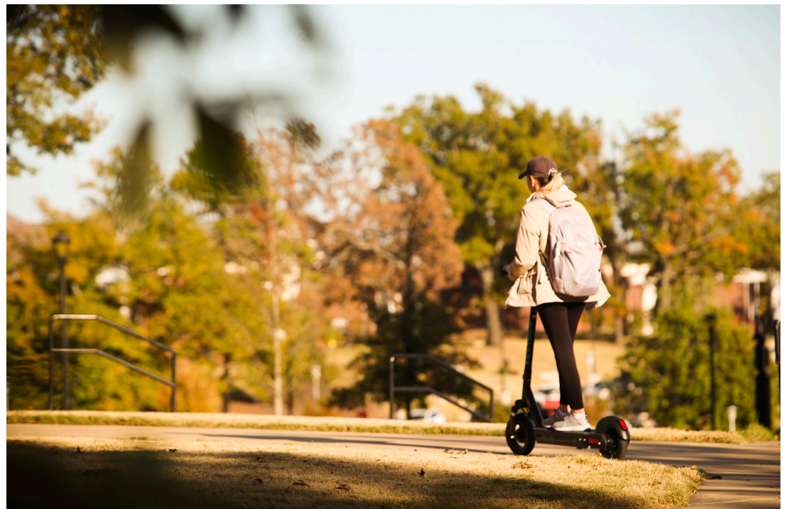
Students are particularly having fun riding the VeoRide Scooters around campus in the temperate evening weather.