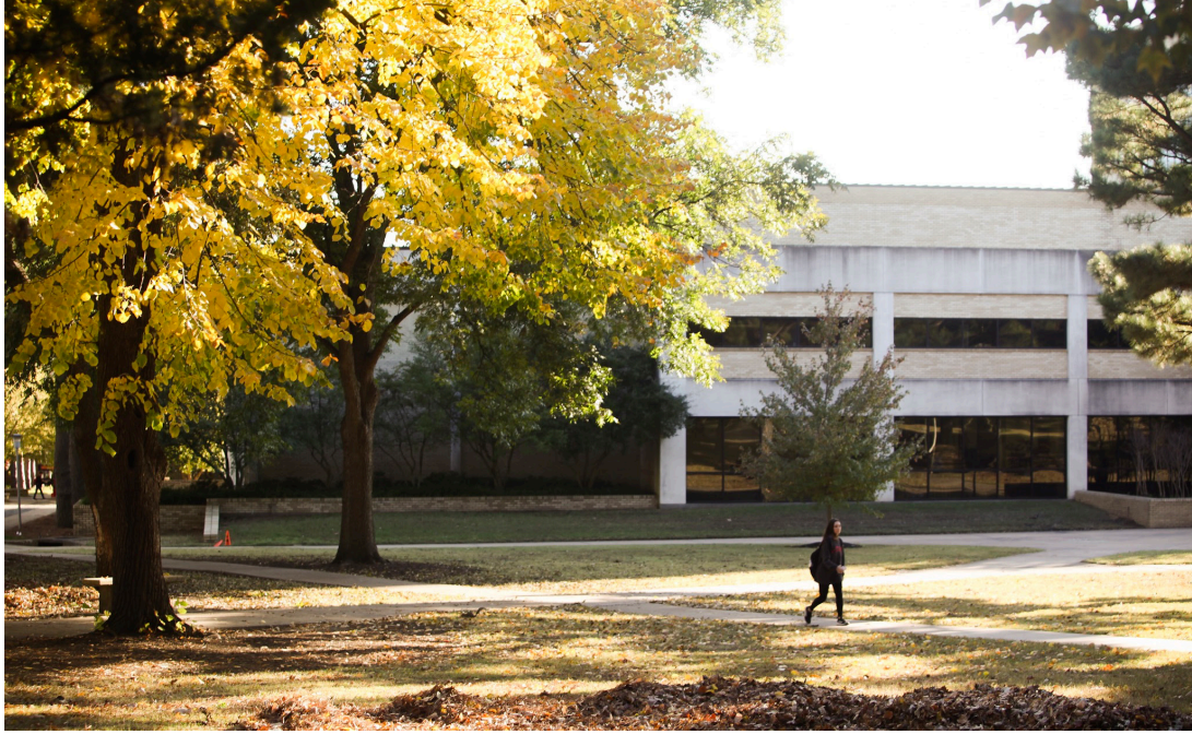
Lately, students are enjoying walking on campus and seeing the changing of the leaves. The autumn season enhances the beauty of the A-State campus.