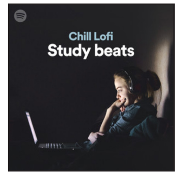
PLAYLIST COVER ART