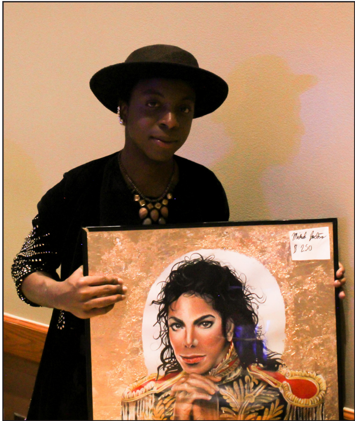
A local artist and their incredible portrait of the King of Pop, Michael Jackson.