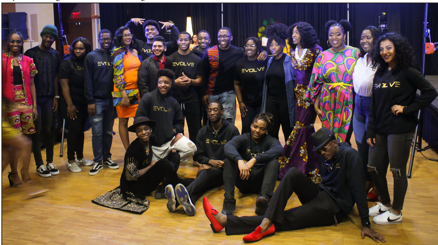
The performers, fashion models, dancers, and members of Evolve gathered together.