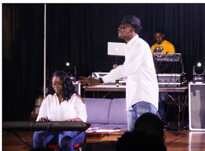
Talented individuals performing their musical numbers.