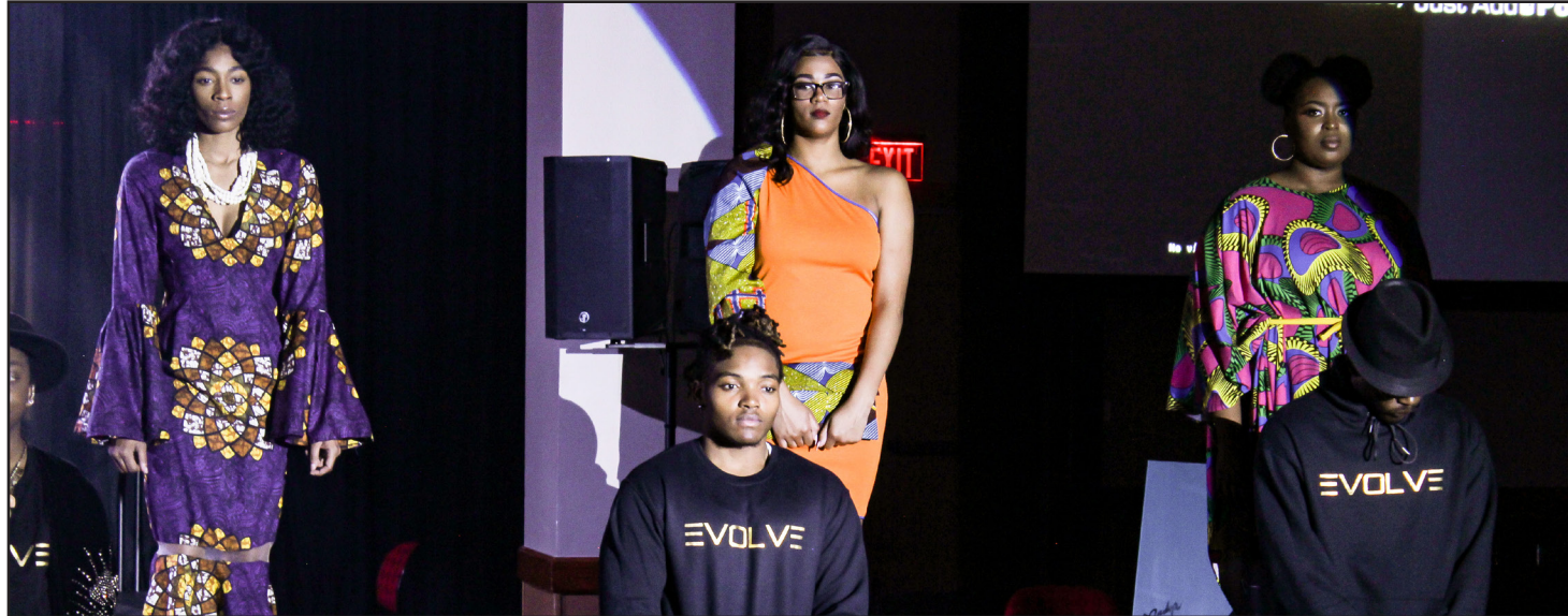
Models showcasing their beautiful, colorful attire on the runway.