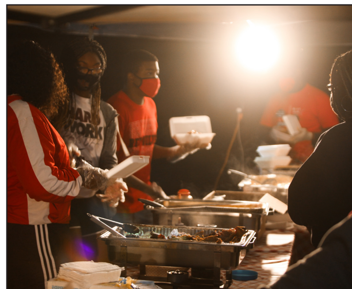
5. Students serving food to individuals attending HowlFest.