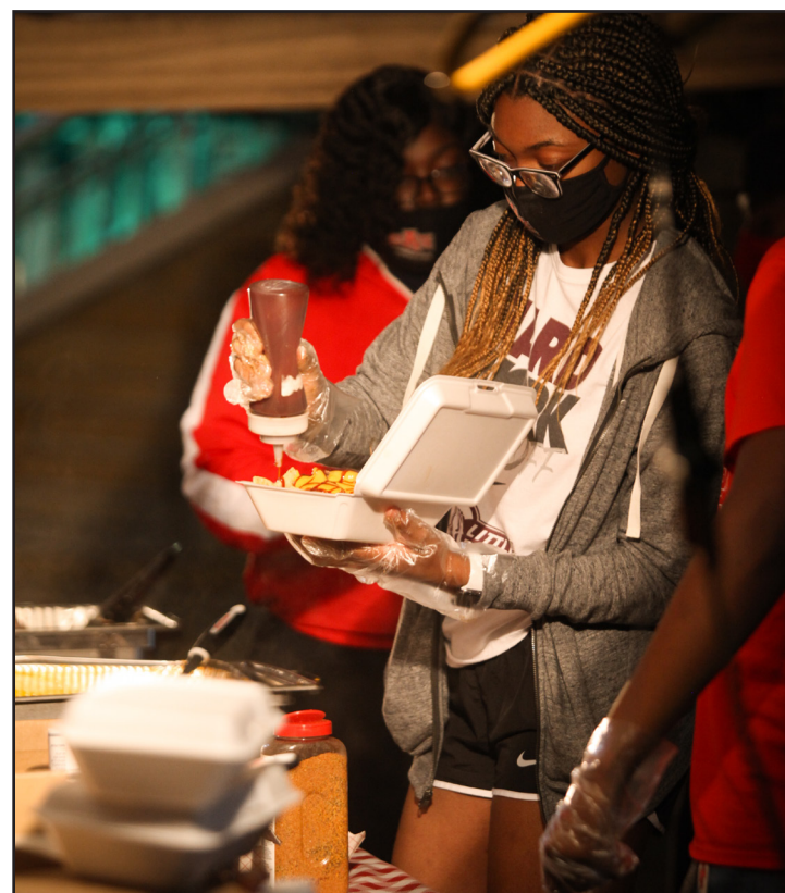
7. A student puts together a plate of Big A's BBQ.