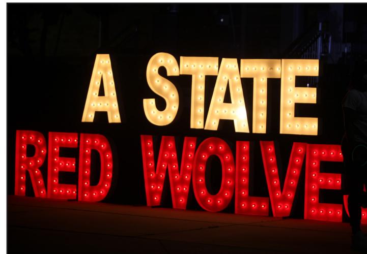
2. The A-State Red Wolves sign lighting up the stage.