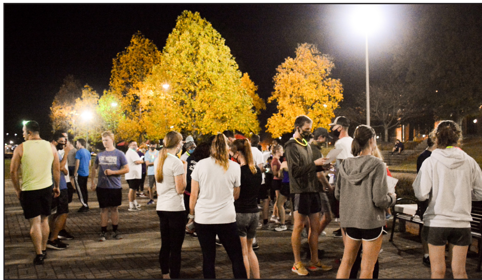
The race participants getting ready at Heritage Plaza Lawn by signing in, putting on their glow-stick bracelets and masks, and finding their friends.