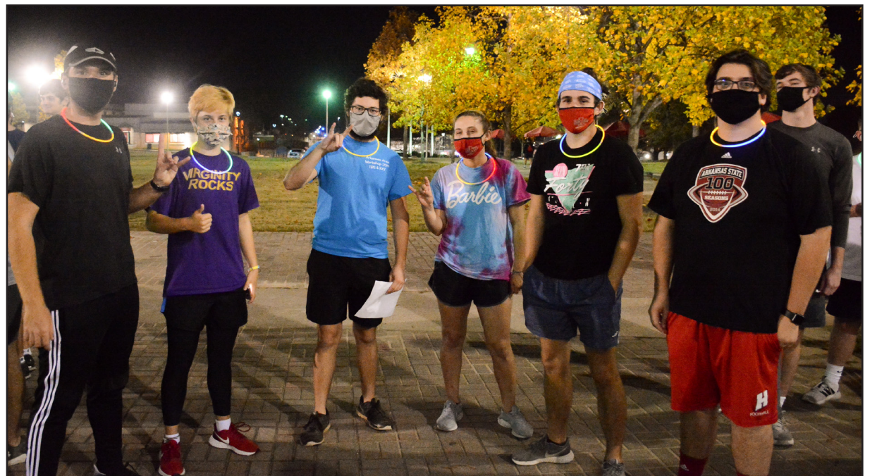
A-State students gather together shortly before the 5K.