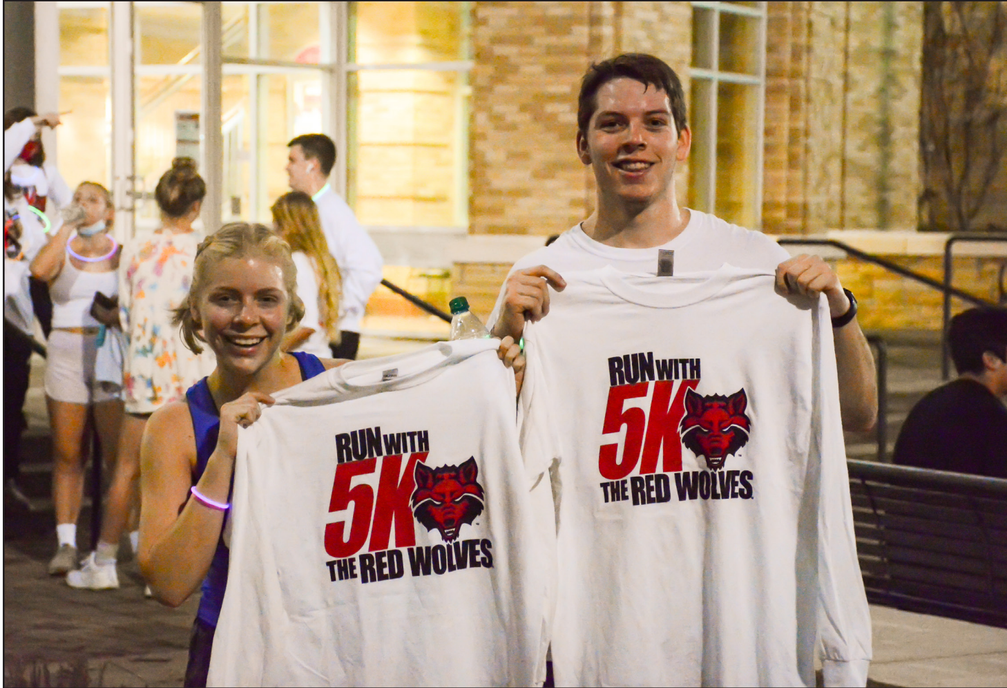
A-State students hold up their Run With the Red Wolves 5K shirts after the race. The race had a large turnout due to the promise of a free shirt given to the first 100 finishers. The race was held on the A-State campus Monday night.