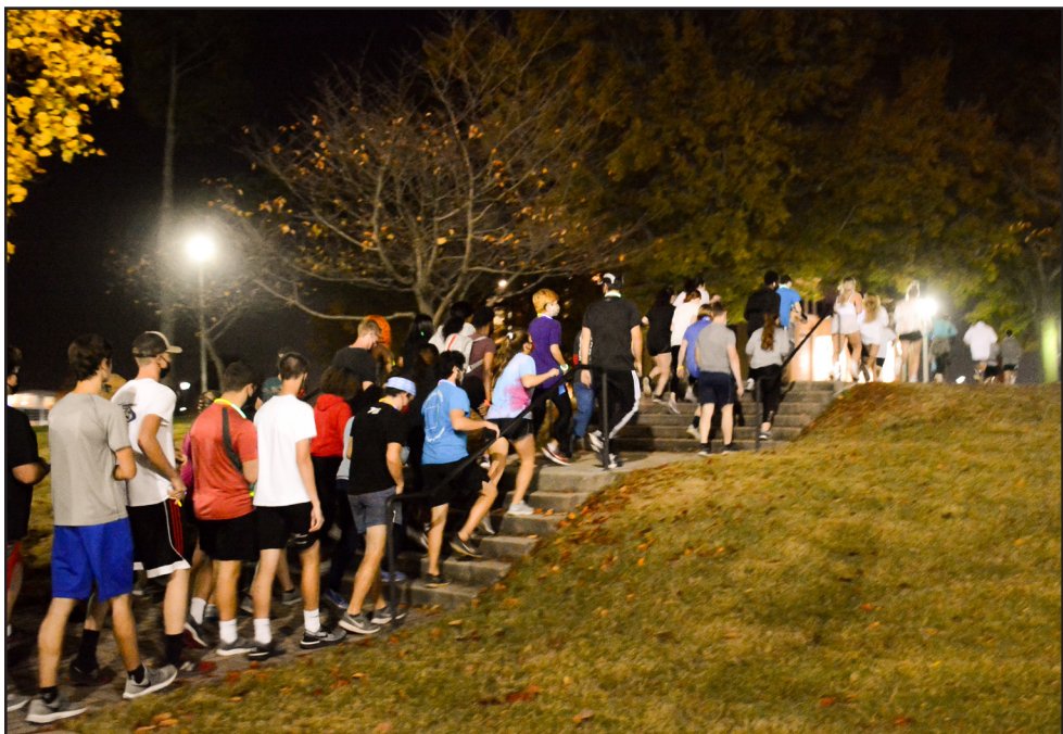
The 5K runners and walkers go up the stairs at Heritage Plaza Lawn to begin the race in front of Humanities.