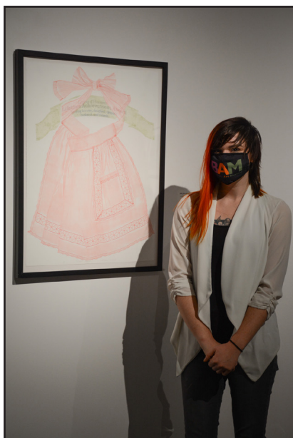
The Delta National Small Prints Exhibition will be available until Feb. 17. The museum is free and open for public viewing Tuesday to Saturday, noon to 5p.m.