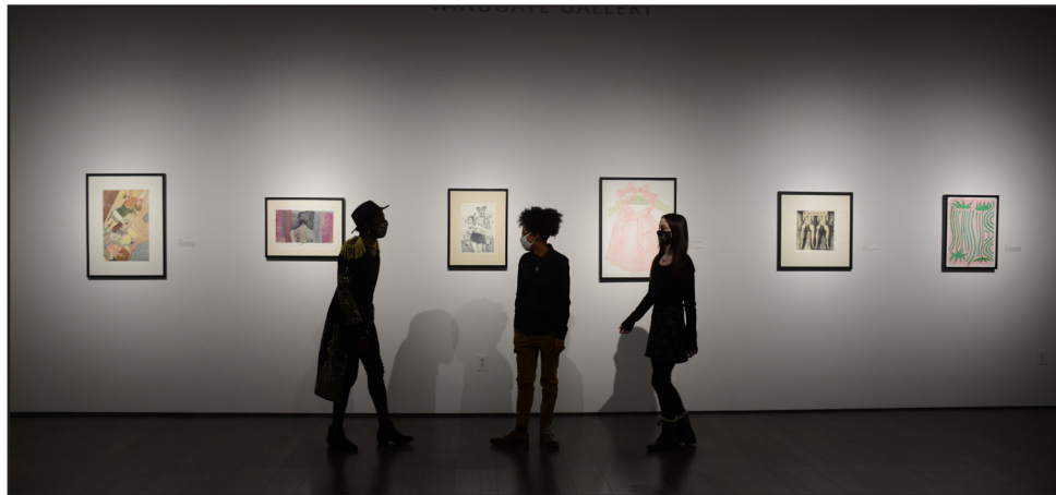
A-State students walking around the gallery, looking at the collection.