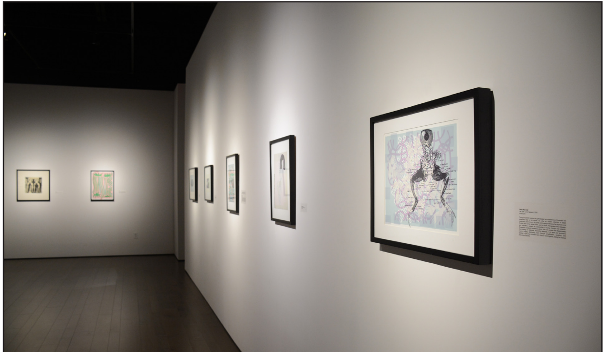
The Delta National Small Prints Exhibition is now available for viewing at the Bradbury Art Museum. The exhibit is a collection of digital prints, watercolor pieces, and 3D lenticular media.