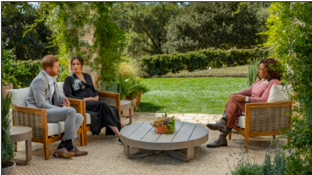
SCREENSHOT COURTESY OF CBS