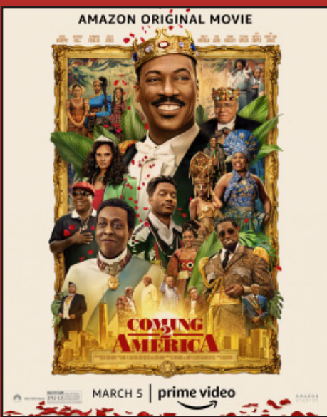
OFFICIAL RELEASE POSTER

"Coming 2 America" is the sequel to the 1988 comedy, "Coming to America" and is available to stream on Amazon Prime.