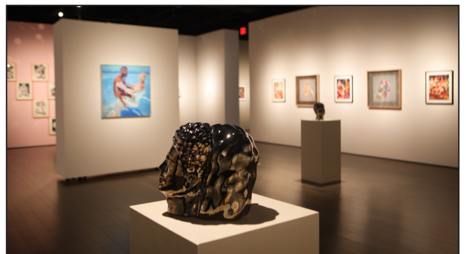
"Hubris (Duality)", a sculpture by Kevin Kao, features among the many detailed gallery pieces in the "Star Children" collection.