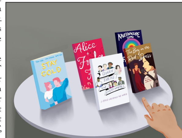
ART BY THINH VU | CONTENT CREATOR

If you don't agree with me, feel free to restrict what media your children have access to, as parents across time have done when faced with issues they disagree with. But attempting to restrict what media ALL children have access to is incredibly selfish. Whether you believe LGBT issues are "appropriate" for youth should not affect how other parents choose to raise their children. Forcing your views on people like this makes you no better than the LGBT people you complain won't "keep all that to themselves," doesn't it?