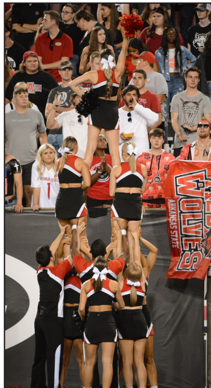
Cheerleaders doing a stunt to enliven the student section.