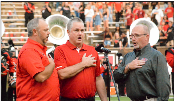
The Mayor of Jonesboro, Herald Copenhaver (right), an A-State alum, singing The National Anthem.