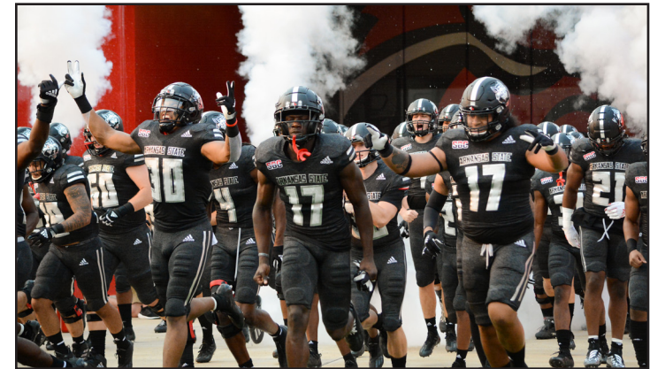
The Red Wolves making their game entrance with smoke machines and excited fans.