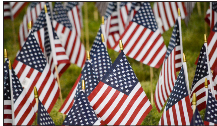
American flags decorating the grass by the student section in memoriam of Sept. 11.