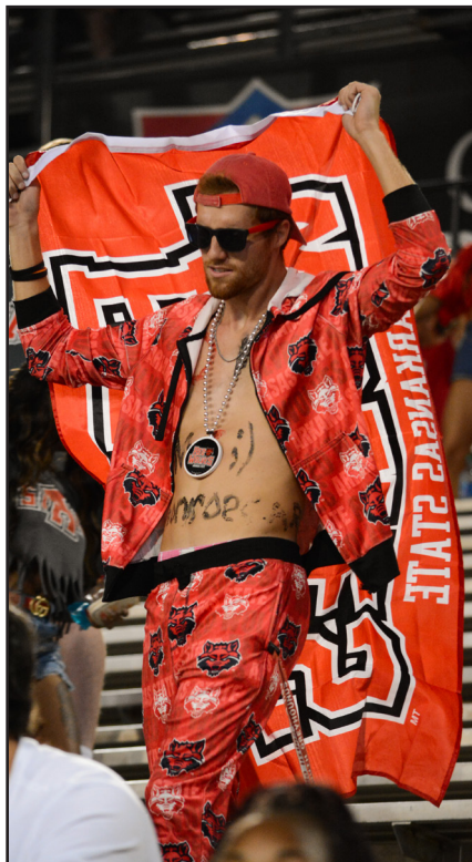
An enthusiastic fan in the student section flying an A-State flag.