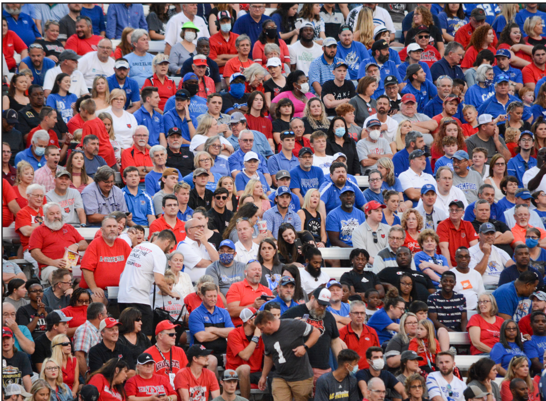
The fans enjoying the A-State Red Wolves football game at Centennial Bank Stadium, Saturday. The nail-biting game ended in a 50-55 loss against the Memphis Tigers. In remembrance of 9/11, members of the crowd involved in the armed forces were asked to stand and were met with loud applause. For more information on the game, see the Sports page article on 2B