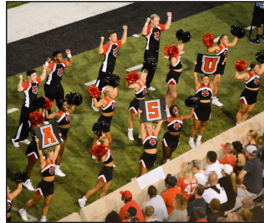
The Spirit Squad leading cheers.