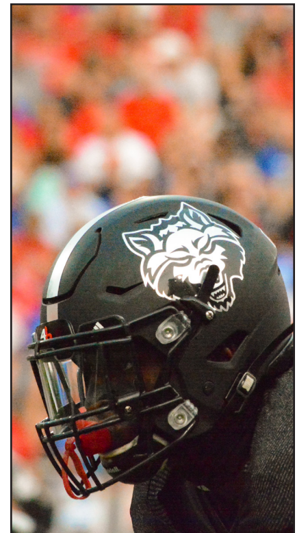
An A-State Red Wolf positioned to run on the line of scrimmage.