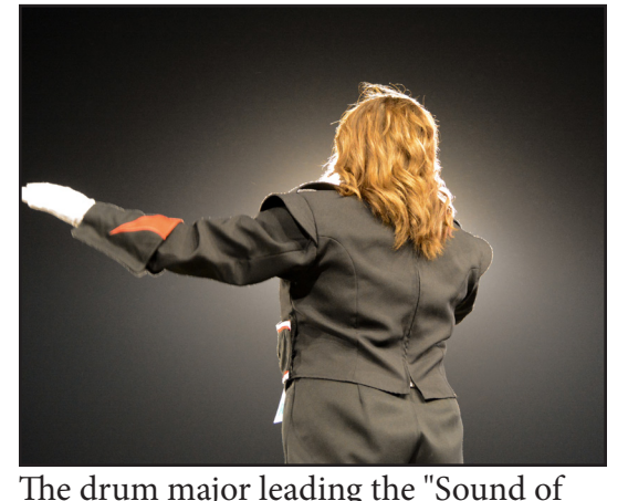
The drum major leading the "Sound of the Natural State."