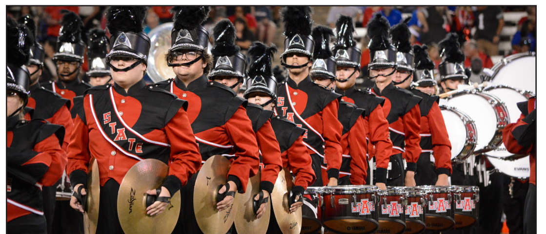
The Sound of the Natural State band playing "Fanfare for the Common Man," "Amazing Grace" and "America the Beautiful" at the halftime show.