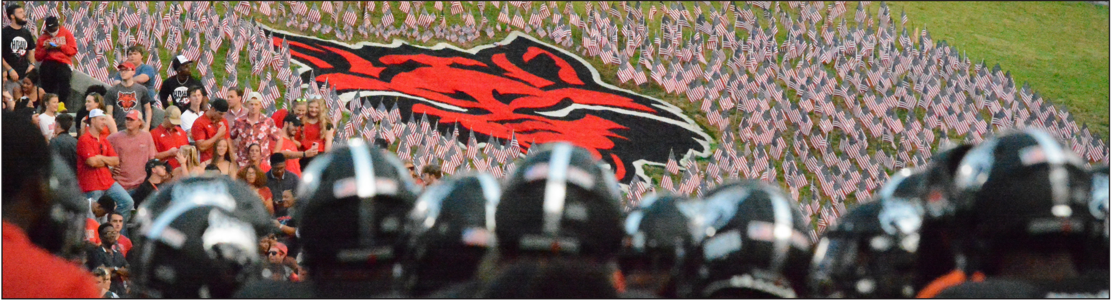
Small American flags on the grass surrounding the Arkansas State University Red Wolf symbol to symbolize the remembrance of the events on 9/11.