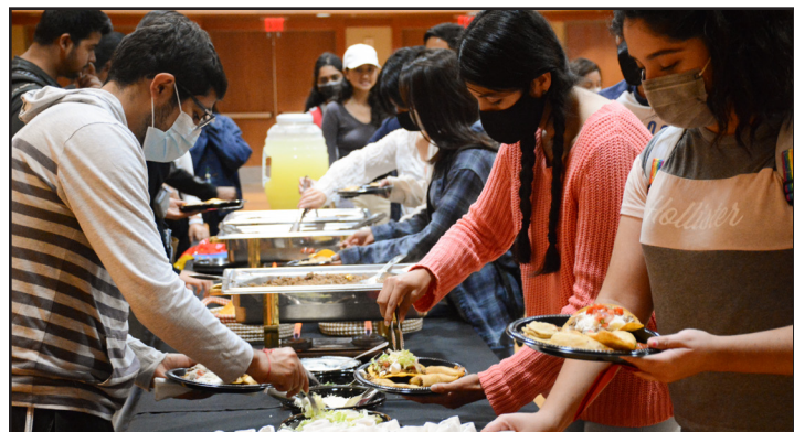
This is the first annual Latin Food Festival, created to introduce people to Hispanic culture through food.