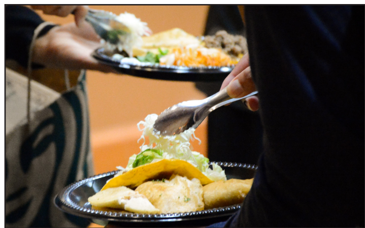
Students filling their plates with traditional Latin foods.