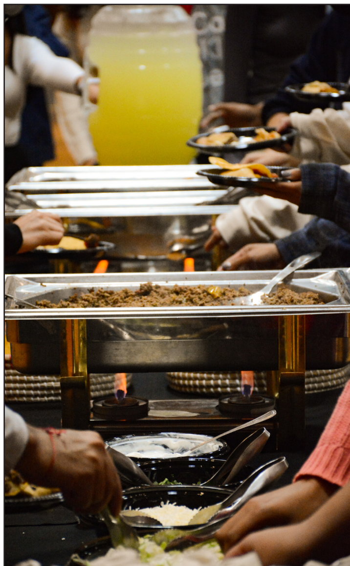
The food provided at the Latin Food Festival.