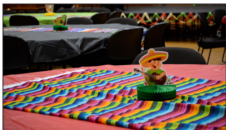
The decorated tables at the Latin Food Festival in Centennial Hall, Thursday night.