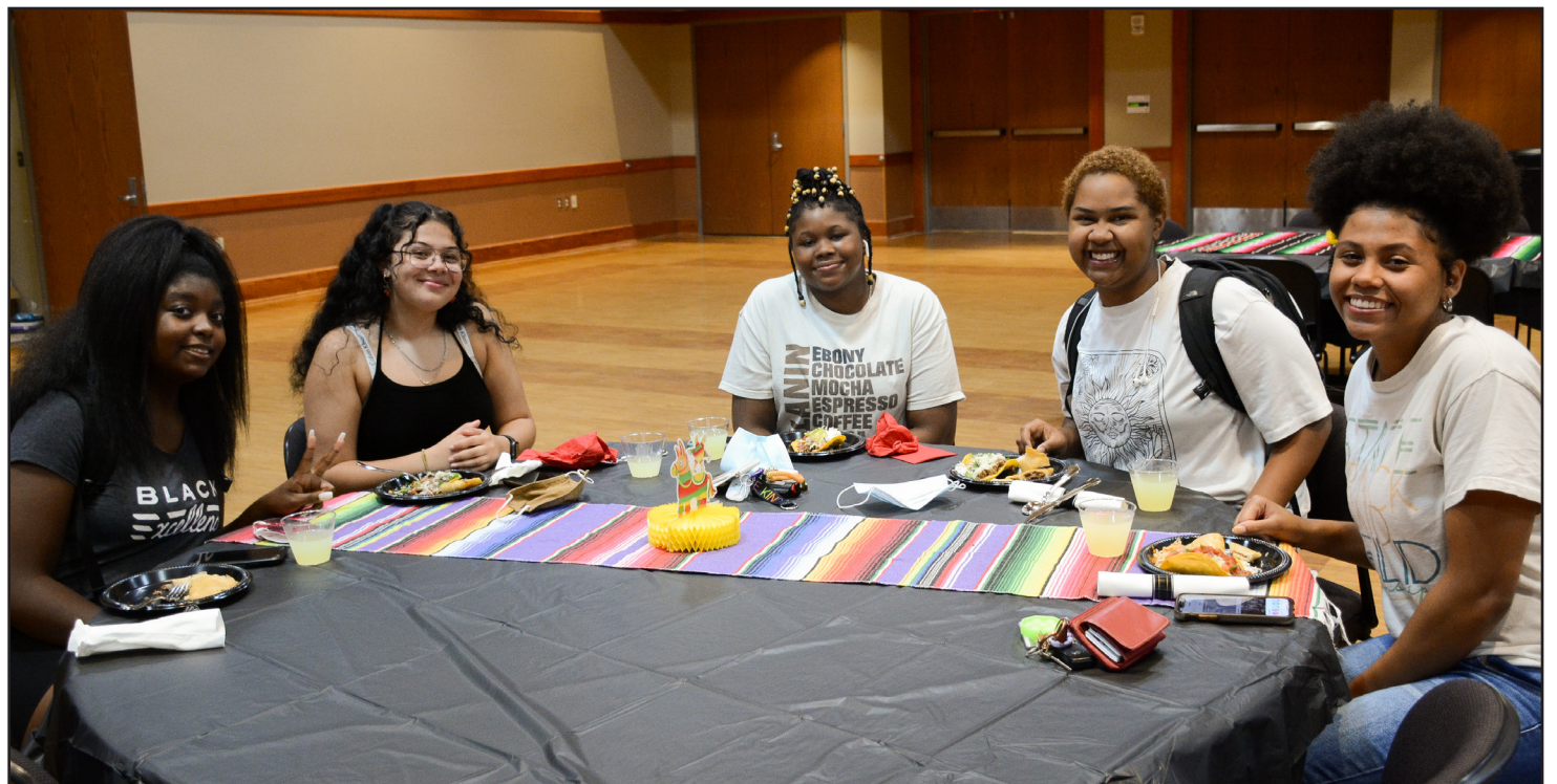
Students enjoying the food, lemonade, and music at the Latin Food Festival during Hispanic Heritage Month.