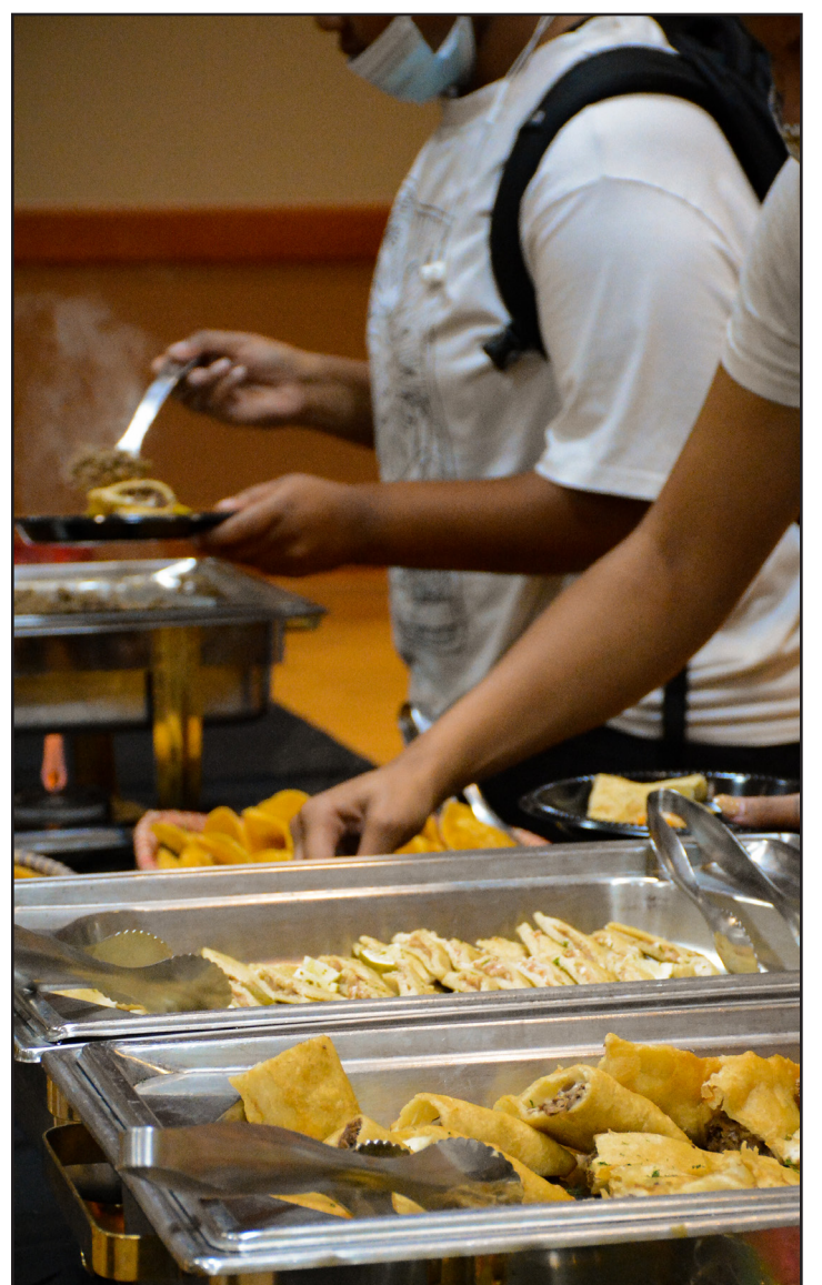
Students grabbing tacos, empanadas, and more.