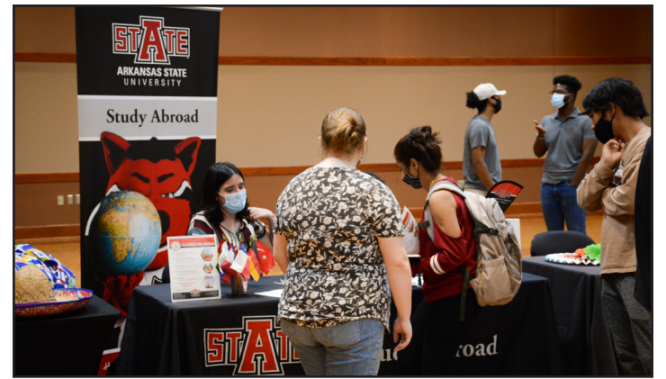
Students visiting the Study Abroad booth at the festival. Each booth had a pamphlet and a representative to aid with student questions.