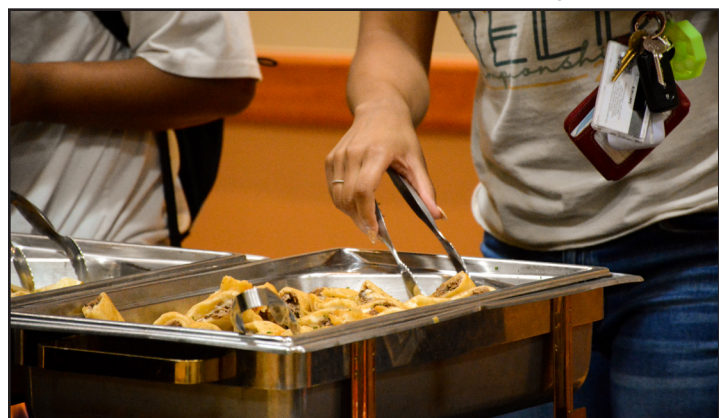
The Food Festival is the first of many events celebrating Hispanic Heritage Month. The next event is the Hispanic Heritage Museum night on Thursday, Sept. 23 at 6 p.m. in Centennial Hall.