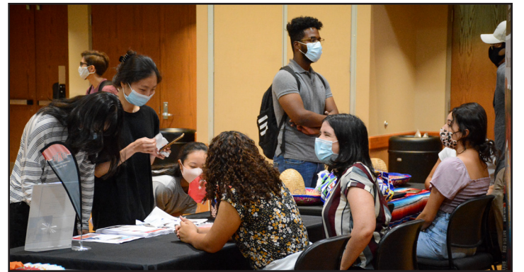
Students conversing with representatives of the Study Abroad program.