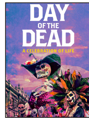
“Day of the Dead: A Celebration of Life” (2020) - dir. Denise Richards