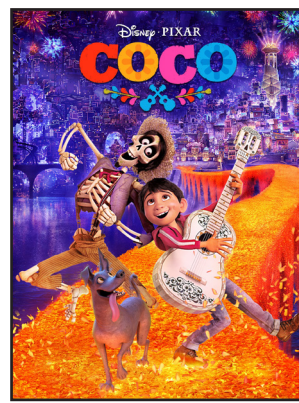
“Coco” (2017) - dir. Lee Unkrich

as “Mexican Halloween,” this is inaccurate. Halloween derives from a Celtic festival of lighting bonfires and wearing costumes to ward off ghosts, while Day of the Dead is a celebration of death as a part of life. Below are a few recommendations of things you can watch or read, which accurately portray Mexican culture around Día de los Muertos.