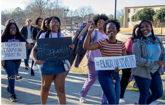
2. A group of students walking for unity.