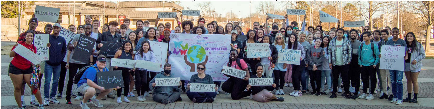
4. The students and A-State community members gathered to take part in the Unity March for Zero Discrimination Day, March 1.