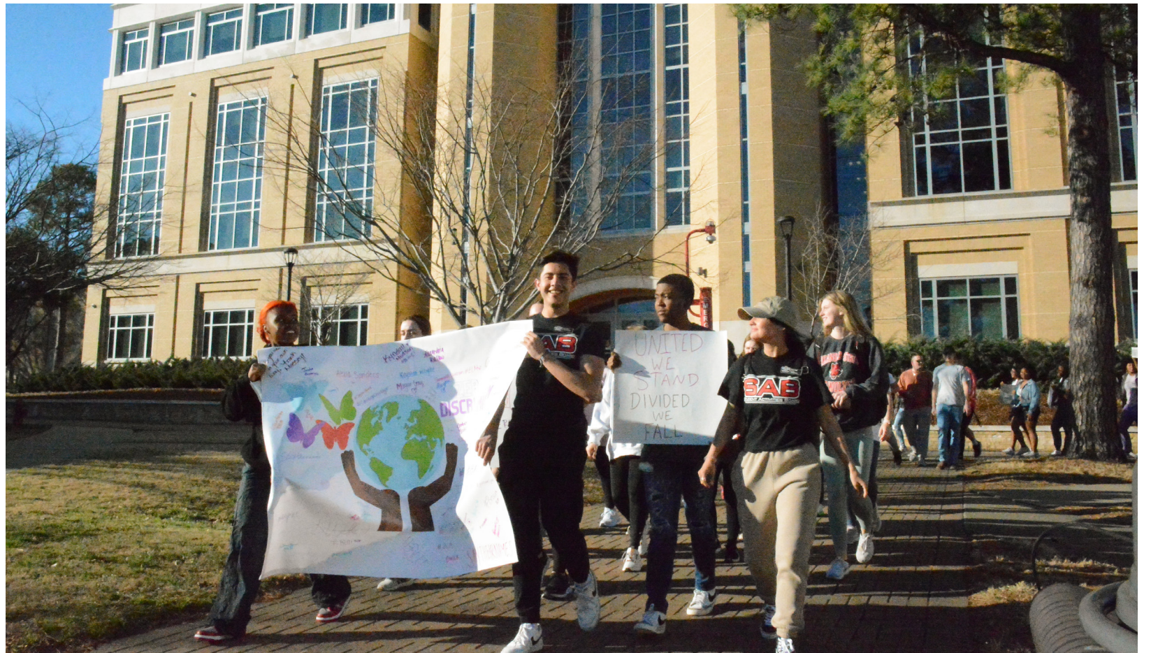
10. Student Activities Board members leading the Unity March in front of the Humanities and Social Sciences Building and carrying the banner with signatures of the marchers for Zero Discrimination Day.