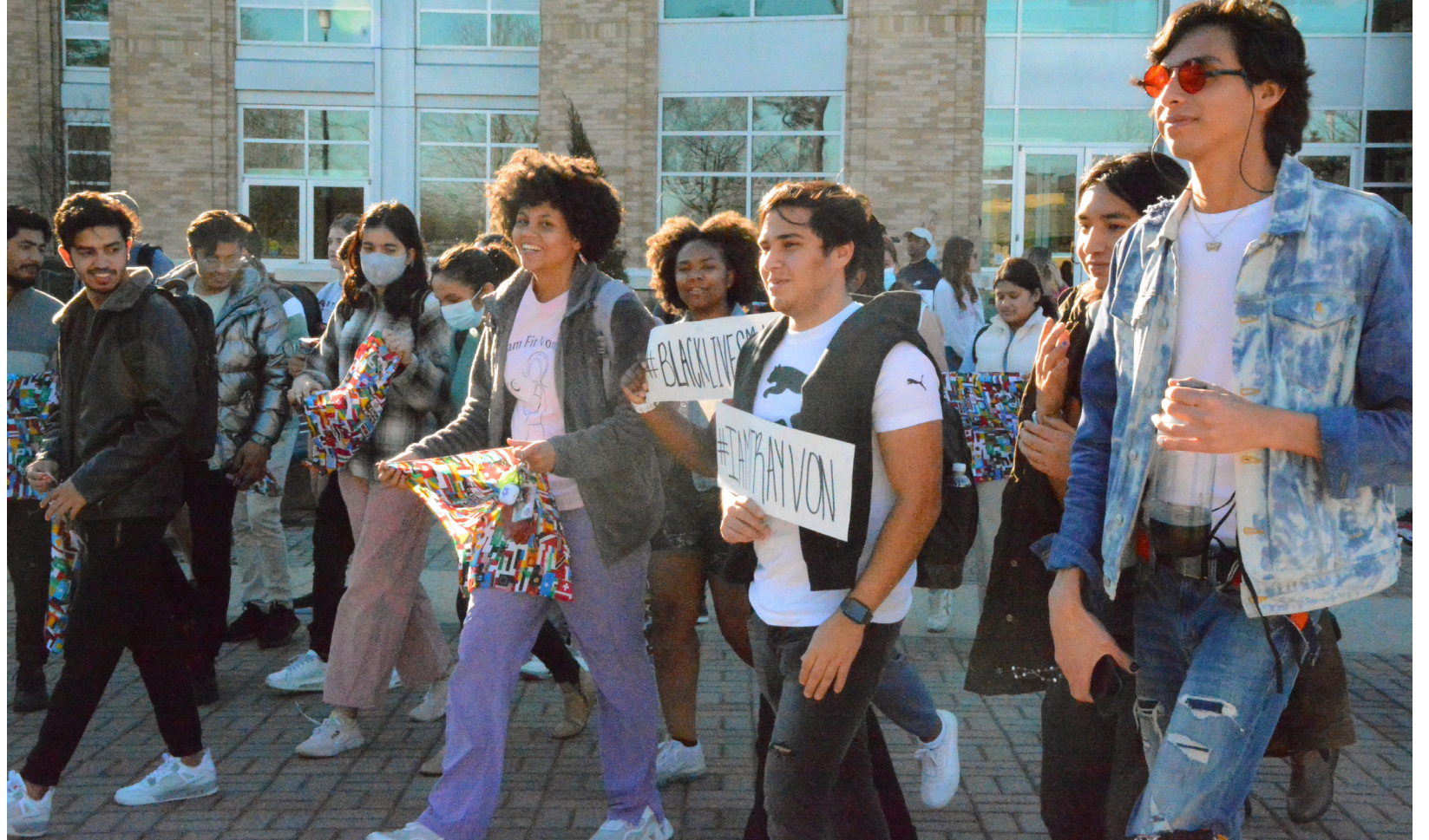
3. Students begin the Unity March at the Carl R. Reng Student Union on Heritage Plaza Lawn. Close to one hundred students, staff, faculty and A-State community members joined in the march around the A-State campus.