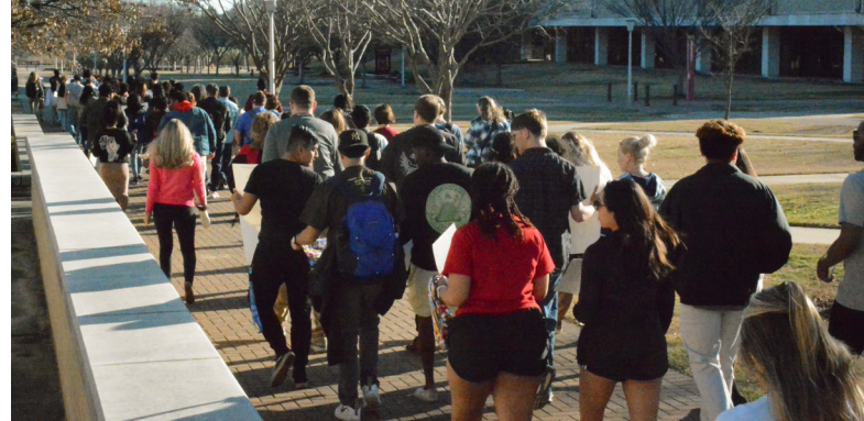
5. A student holding a sign, walking in the Unity March on campus. 6. Marchers with signs celebrating Zero Discrimination Day.