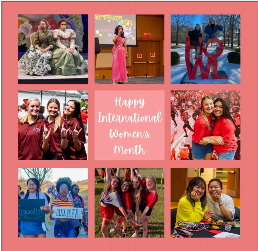
1. March is Women's History month and A-State has numerous events such as a book club, yoga and forums to celebrate.