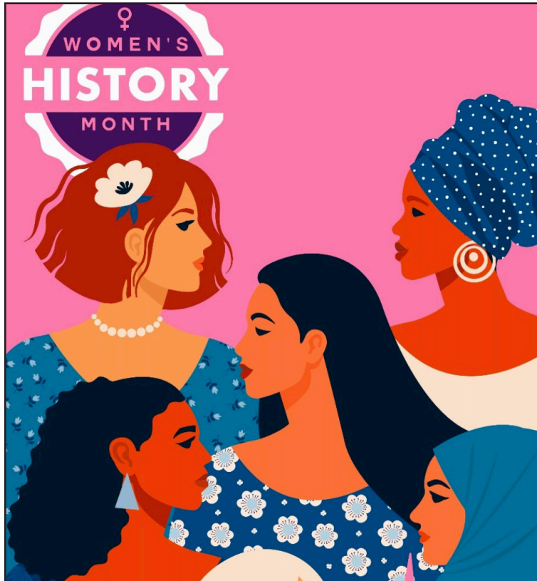
2. In the midst of Women's History Month, March 8 has been founded as International Women's Day since 1914.