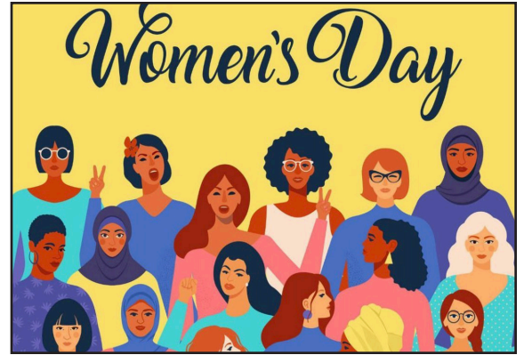
3. International Women's Day, March 8.