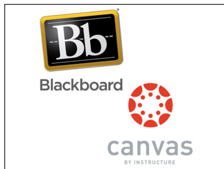
Arkansas State makes plans to leave Blackboard for Canvas. One of the benefits of Canvas is the app is better suited for mobile devices. Faculty will not have to transition to Canvas until June 2023.