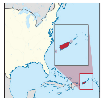
Top Photo: A-State Alumnus John Dellorto in Puerto Rico. Bottom Graphic: A Map of path Hurricane Fiona is on. Side Map: Puerto Rico's location next to the United States.