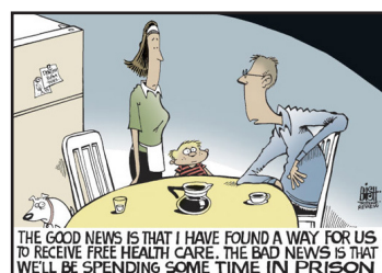
COMIC BY RANDY BISH

Due to technical difficulties, polls are put on hold.