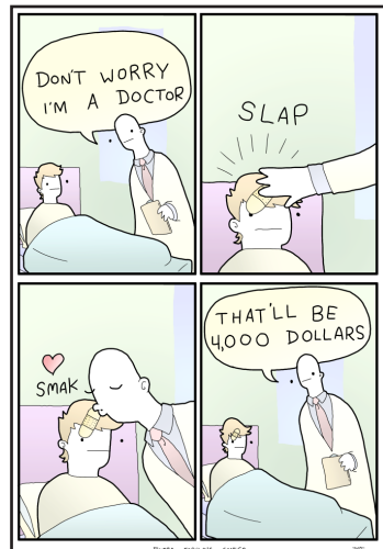
COMIC BY EXTRAFABULOUSCOMICS