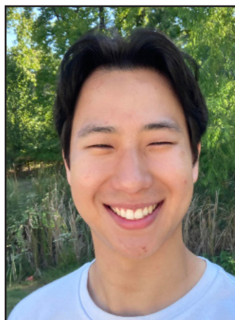
COLUMN BY YONGJUN KIM