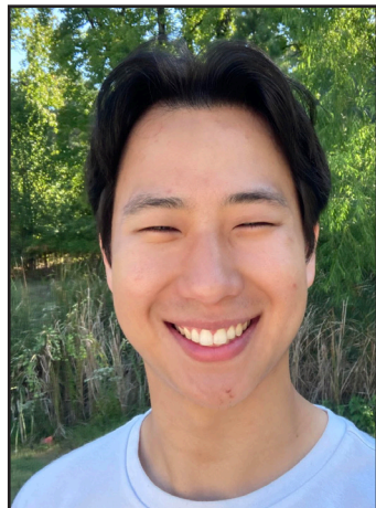
COLUMN BY YONGJUN KIM