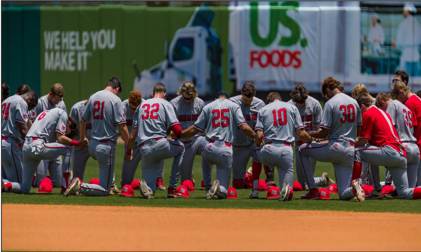
The Arkansas State baseball team gets together to pray before the game