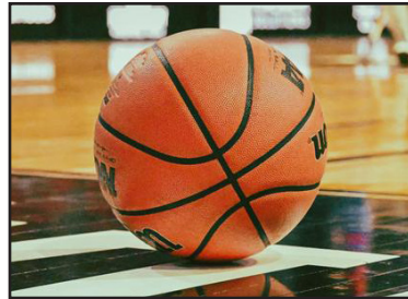
A basketball resting on the court.