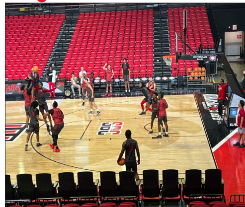
MEN'S BASKETBALL TEAM PRACTICING