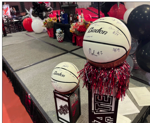
SIGNED BASKETBALLS BY THE MEN'S BASKETBALL