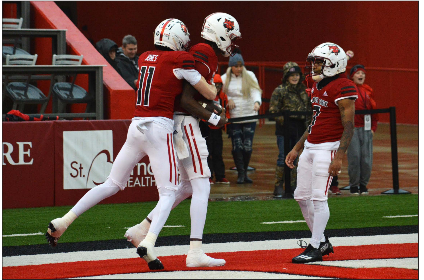
The Arkansas State offense gets together to celebrate a touchdown against Troy.

"In the fourth quarter we were only down 20-19, and then the pick-six and turning the ball over two consecutive times. We did not do a good job of maintaining field position. In the first half we