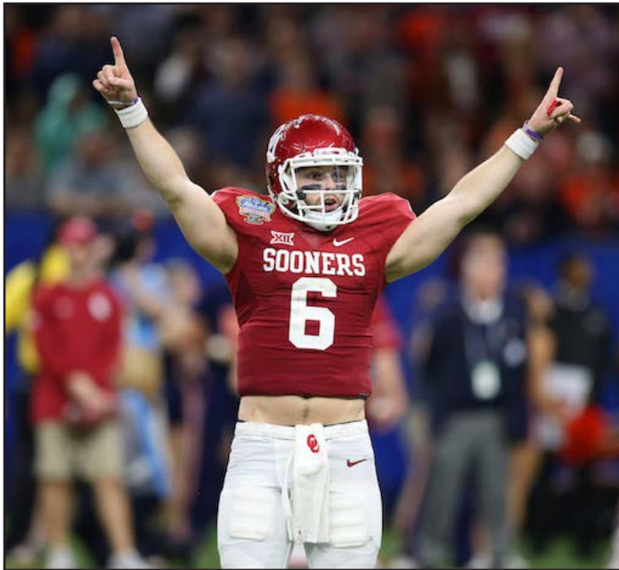
Oklahoma Sooners quarterback #6 Baker Mayfield