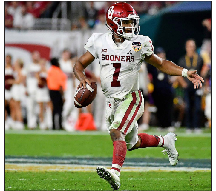
Oklahoma Sooners quarterback #1 Kyler Murray