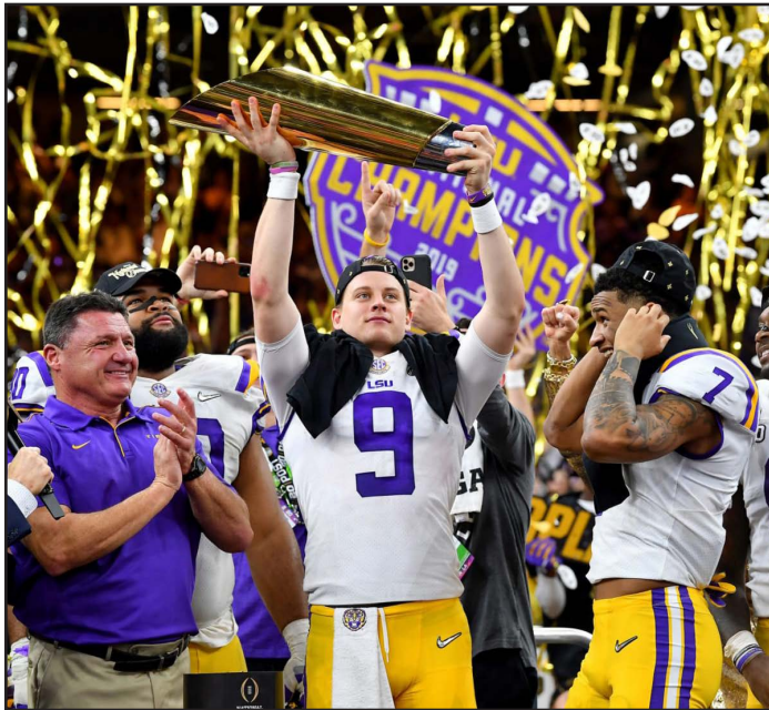
LSU Tigers quarterback #9 Joe Burrow holding up the National Championship trophy.