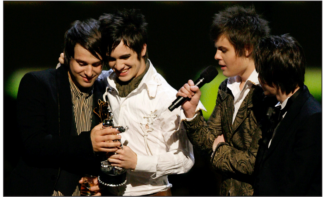
Panic! At the Disco at the MTV Video Music Awards after their win in 2006.

Panic! At the Disco wasn’t the band they used to be and frontman Urie used the name to keep making music and Panic! Transitioned to a solo project. The last three albums under the name were their second live album “ All my Friends We’re Glorious ” in 2017 and two studio albums, “ Pray for the Wicked ” in 2018 and “ Viva Las Vengeance ” in 2022. Though I would say some long time fans dropped