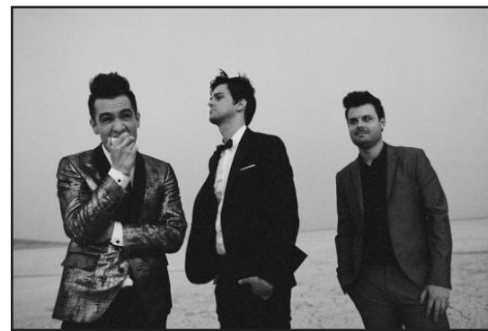
Panic! At the Disco for their fourth studio album.