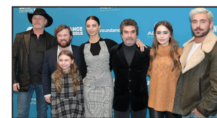
The Cast of "Extremely Wicked, Shockingly Evil, and Vile"

It is okay to theorize with your friends or wonder why something tragic happened. It is not okay to start accusing, to start harassing, to forget all empathy and ethics regarding respect to the victims and their families.