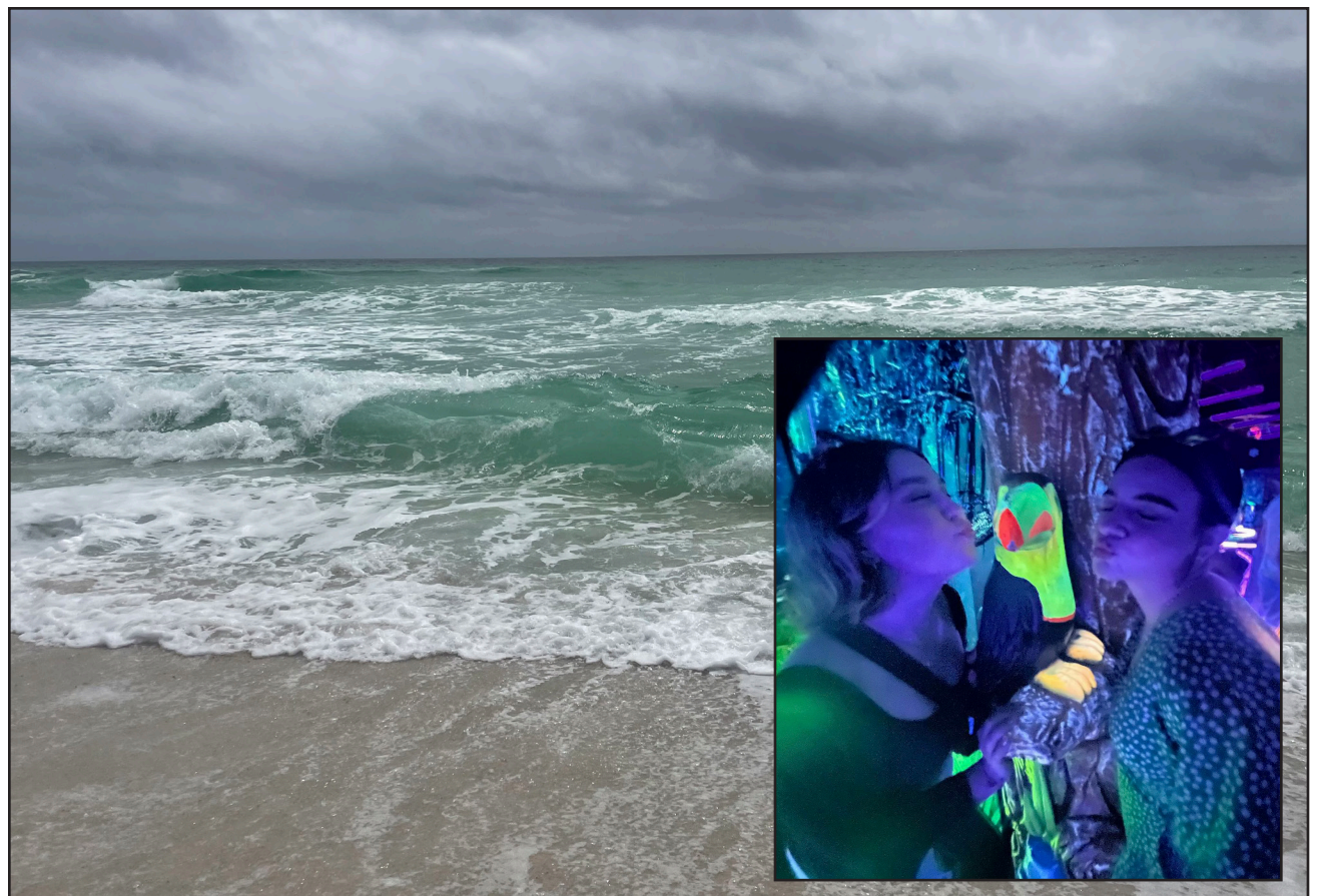
8. The waves at Navarre Beach.