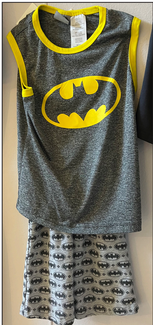
2. "I was sleeping. He would come into my room at night. I didn't like what he did to me. I cried and wet the bed."