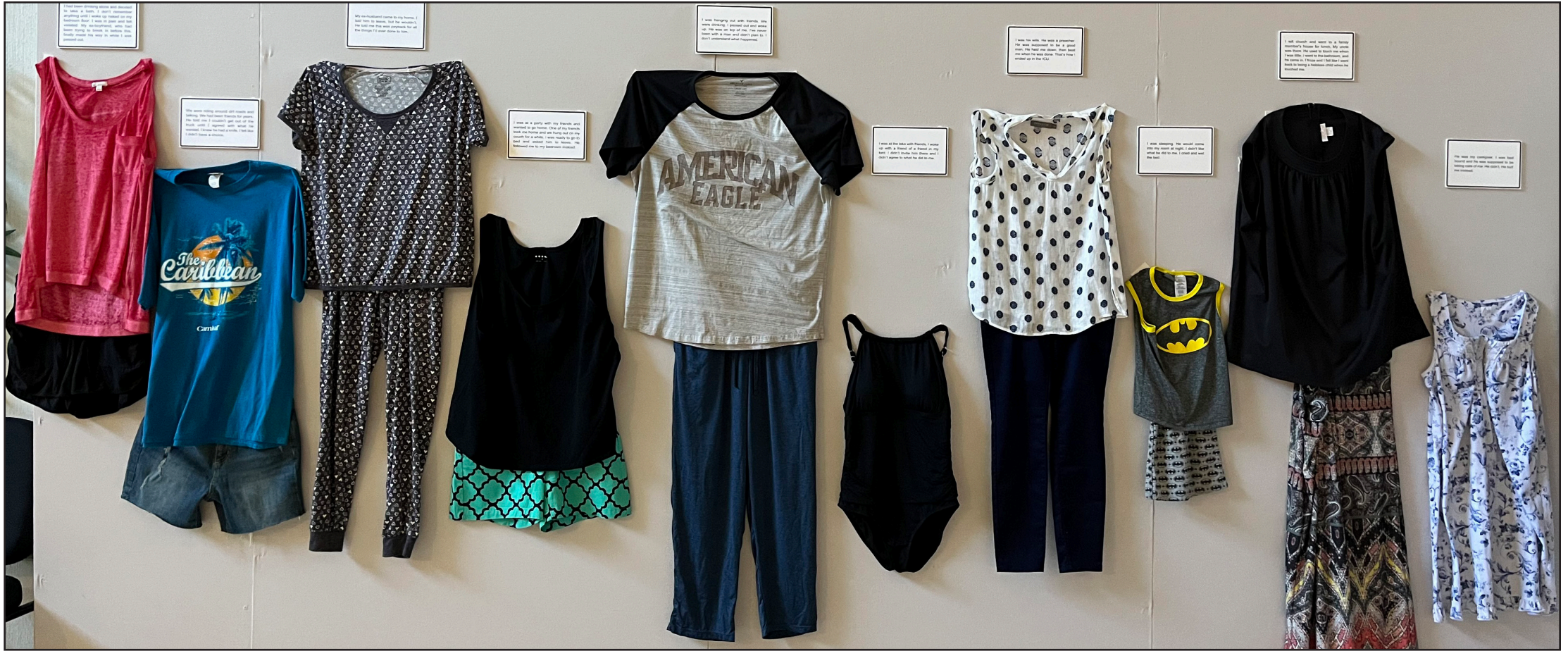
1. The Arkansas State University Museum is displaying the "What Were They Wearing" exhibit through April 28. It shows recreated outfits of local individuals who have been sexually assaulted and shares their true stories. To read the story, go to page 3A.