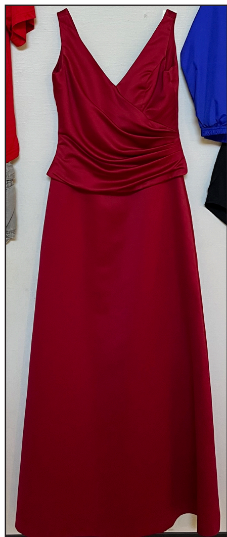
3. "I was a bridesmaid in a friend's wedding. After the reception, we were drinking. I told him no. He didn't stop."