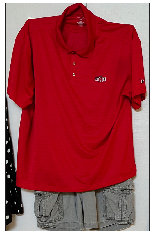
5. "I was at a party. I don't know what they gave me. I woke up and he was behind me. I was screaming when I woke up. I was so scared."