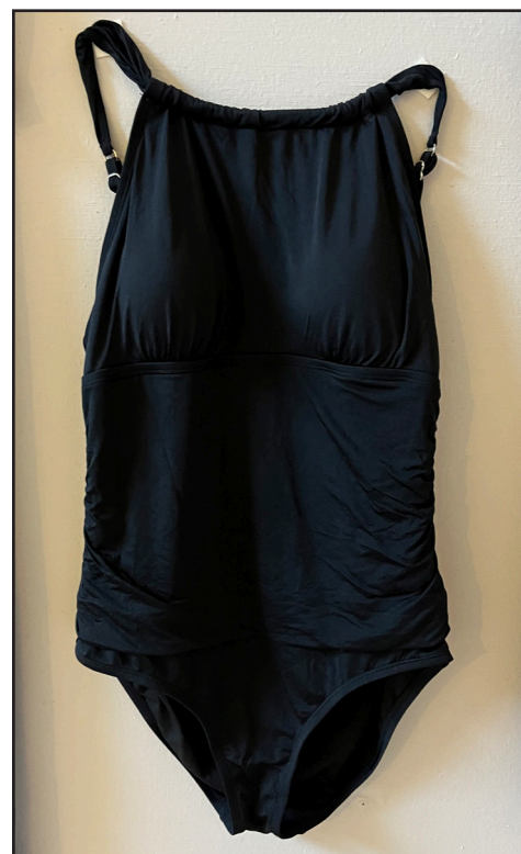
6. "I was at the lake with friends. I woke up with a friend of a friend in my tent. I didn't invite him there and I didn't agree to what he did to me."