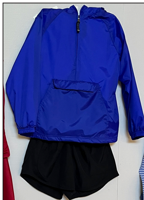
4. "I had plans to hang out with my friend one afternoon, but he never showed up. I woke up to him in my bedroom at 4 in the morning."