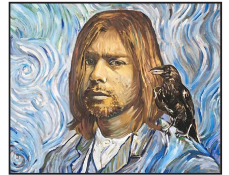
ARTWORK COURTESY OF ZINA GOLMIYYAH Van Gogh style portrait of Cobain

If we continue to be mindful of this reality, we can ensure the message is sent that you do not need to suffer to be a star. But of course, that's just one man's opinion.