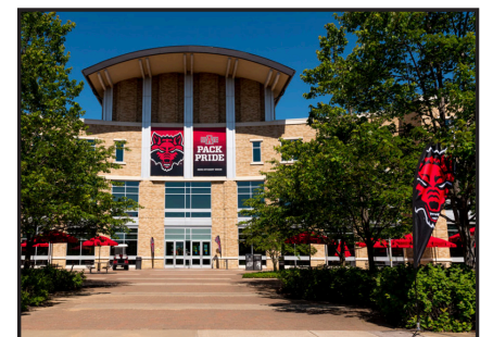
The outside of the Reng Student Union.

Announcements and reminders would go a long way for the A-State student body. The more students that are aware of these resources and actively make use of them, the better off our student body will be.