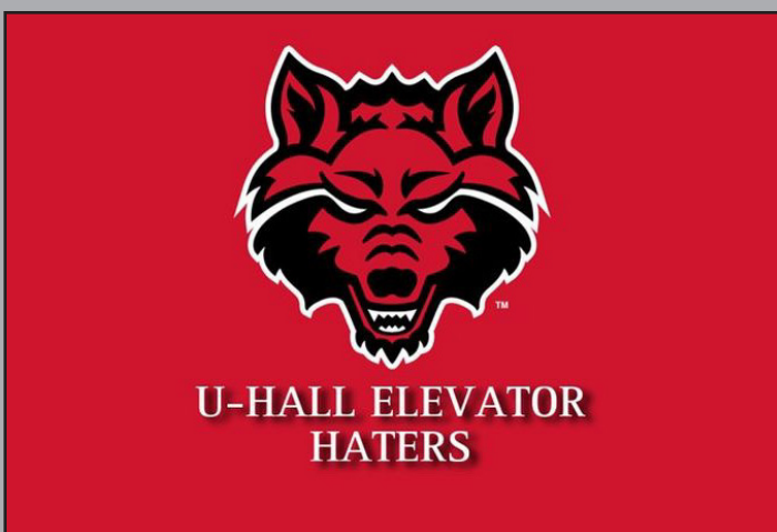
GRAPHIC COURTESY OF JALYNN HAMMOCK The logo for U-Hall Elevator Haters