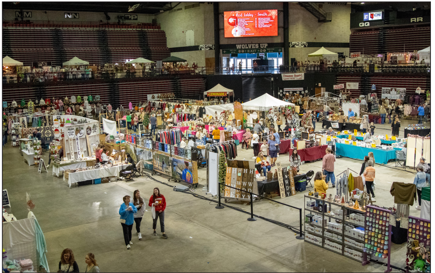
The booths at Lit'l Bita Christmas.

However, as long as you keep looking, you'll be sure to find something that fits both your budget and your style.