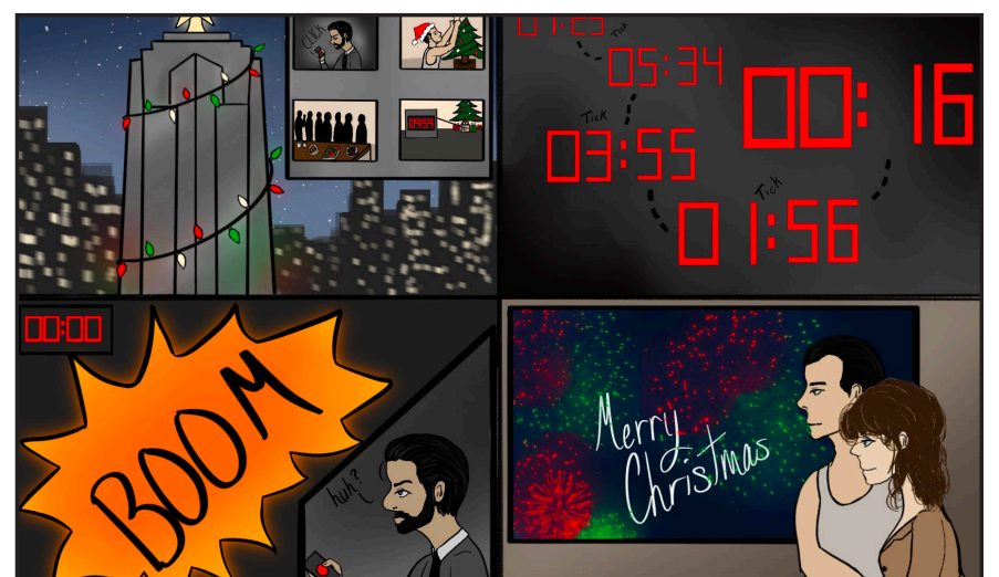
ARTWORK COURTESY OF ADRIENNE ALLS

But of course, that's just one man's opinion.