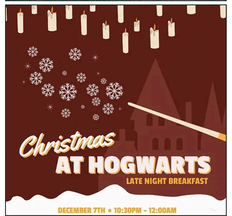
FROM LEFT TO RIGHT: GRAPHIC COURTESY OF A-STATE ART + DESIGN INSTAGRAM, PHOTO COURTESY OF JONESBORO CHRISTMAS TREE PLANTATION FACEBOOK, PHOTO COURTESY OF CHRISTMAS AT THE PARK FACEBOOK, GRAPHIC COURTESY OF ARKANSAS STATE UNIVERSITY