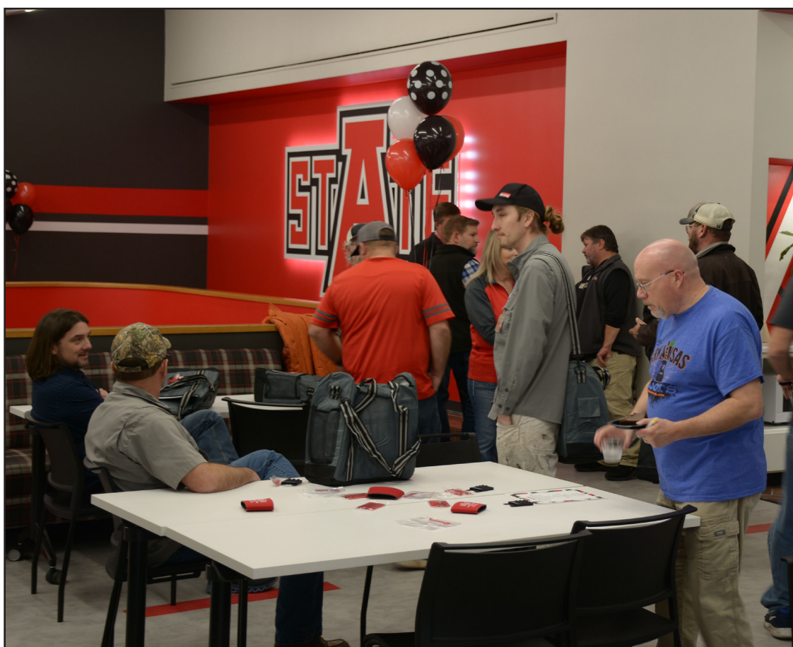
5. The grand re-opening of the student lounge on the second floor of the Education/Communication building took place Friday.