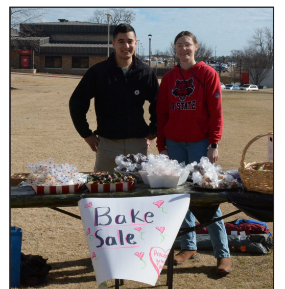
8. Howl's Heroes, a student led organization that fundraises for veterans, held a bake sale in front of the Student Union Tuesday.