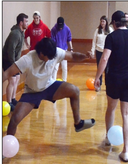
2. Students competed in minigames at the All Campus No More Cancer Rally. The goal of this game was for players to be the last one standing with an unpoped balloon.