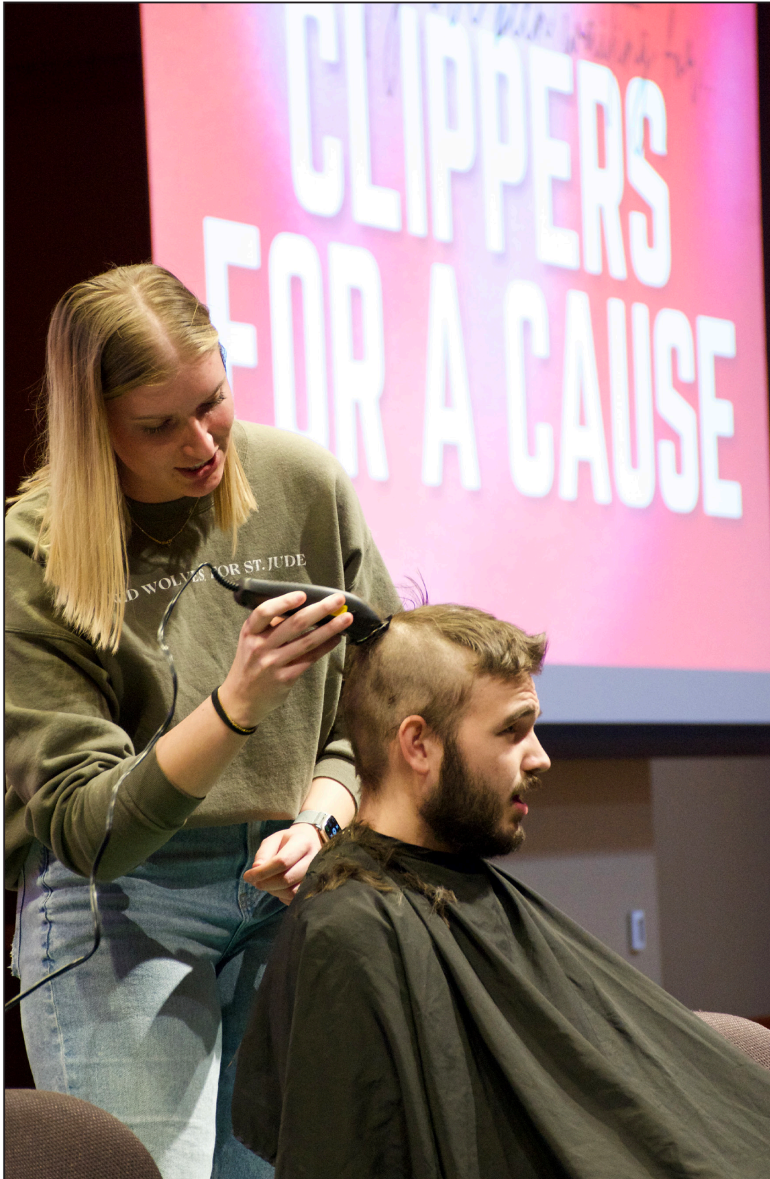
1. Red Wolves for St. Jude hosted an All Campus No More Cancer Rally on Tuesday. At this event, the student who brought in the most donations for St. Jude Children's Research Hospital had their head shaved.