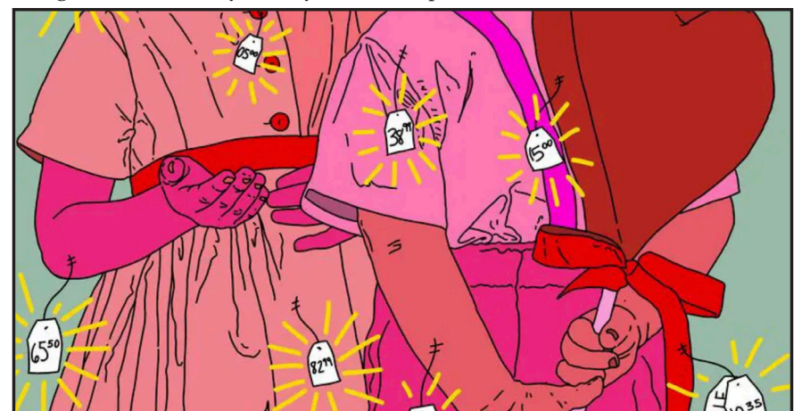
Artist's depiction of the focus on money while giving Valentine's gifts.

But of course, that's just one man's opinion.