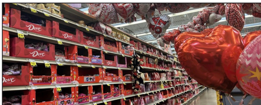
Department store display of Valentine's Day themed items.

Rather than prioritizing the actual relationships, the focus has shifted to cards, candy and flowers that are only