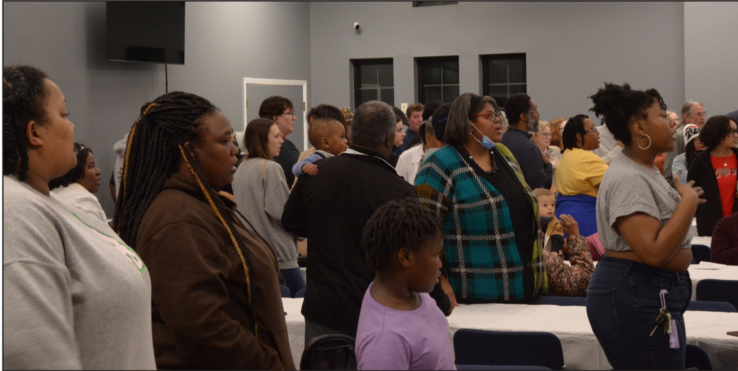
1. The crowd stands for "The Star-Spangled Banner" followed by a singing of "Lift Every Voice," the Black national anthem.