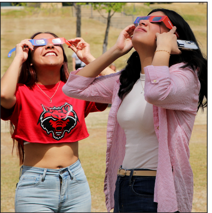
12. Students try out their eclipse glasses while waiting in line for snow cones.