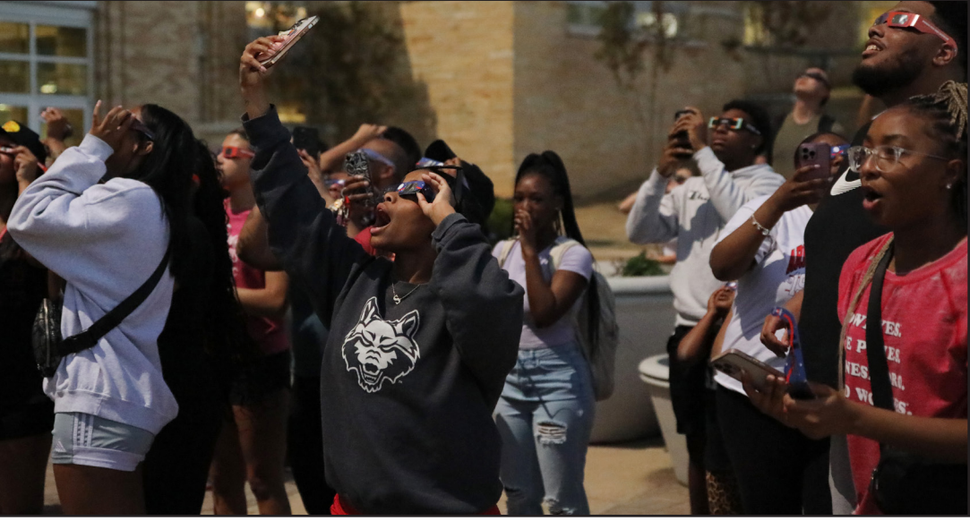
7. Students cheer as the eclipse reaches totality.