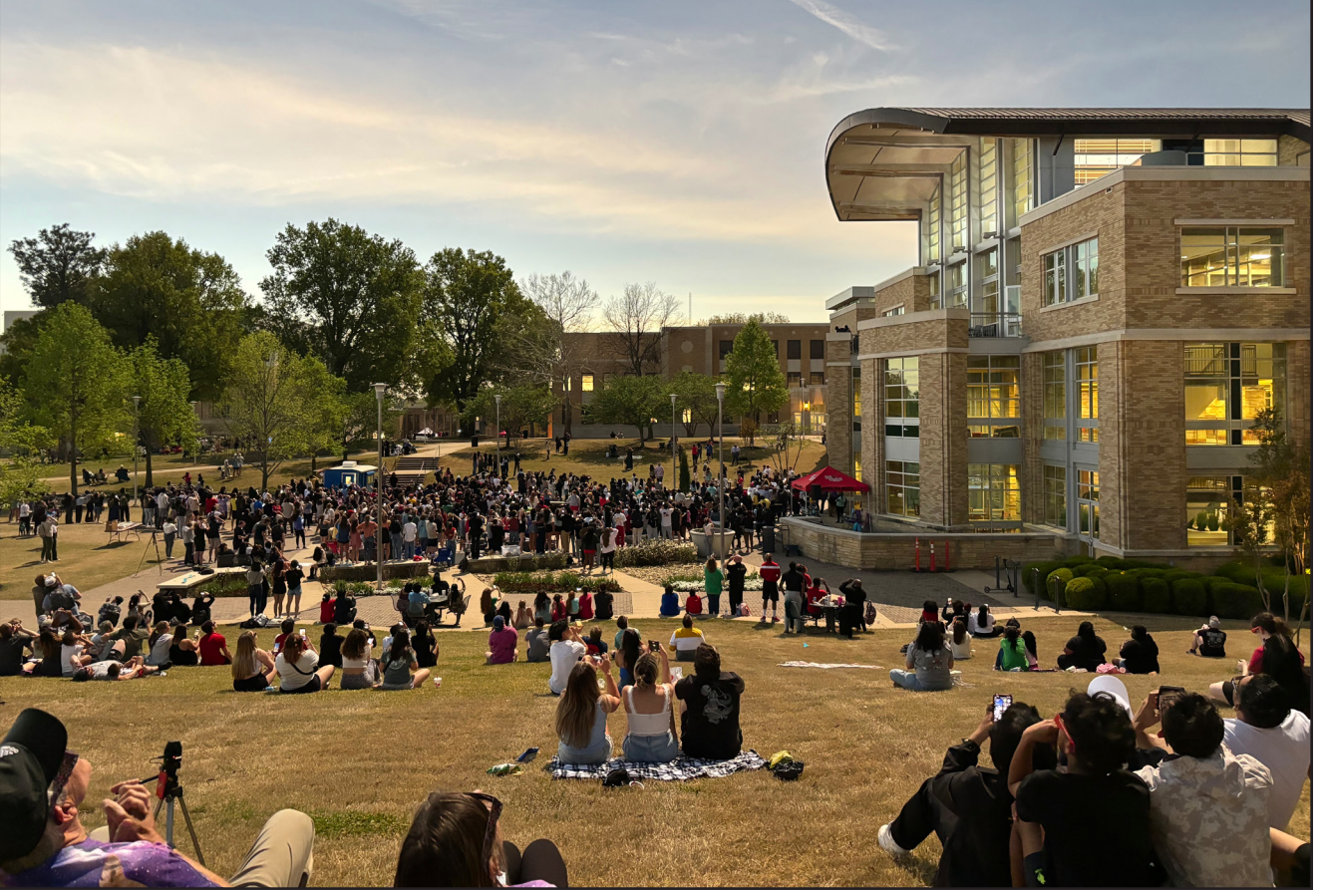
10. Students, faculty and community members gather on Heritage Plaza Lawn as totality begins.