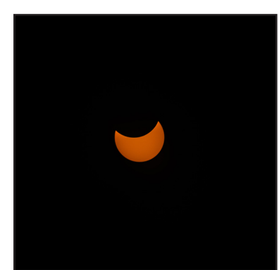
1-5: Phases of the eclipse over Pocahontas, Arkansas.