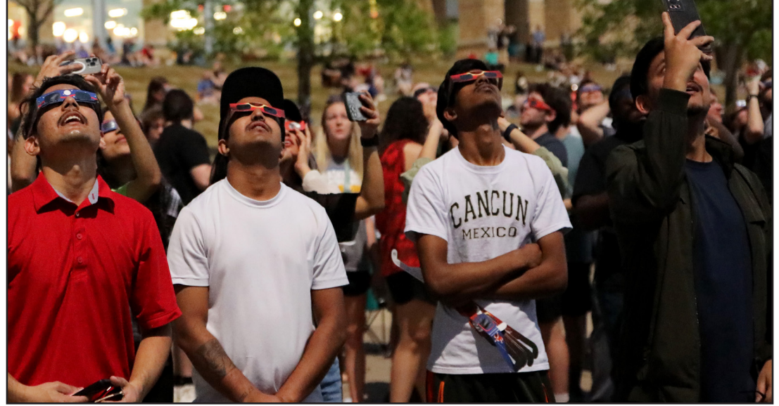
6. Students watching the solar eclipse through eclipse glasses.