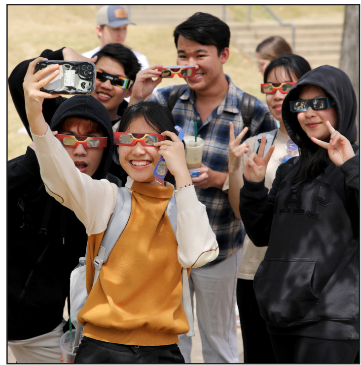
13. Students take a selfie wearing eclipse glasses.