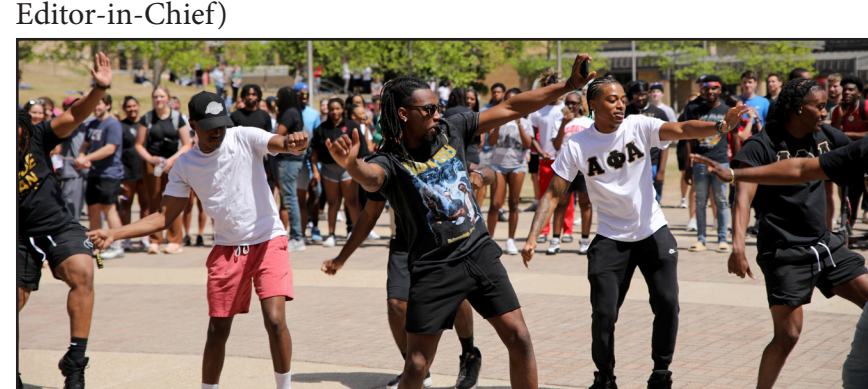
9. Fraternity brothers of Alpha Phi Alpha strolling before the eclipse reached totality.