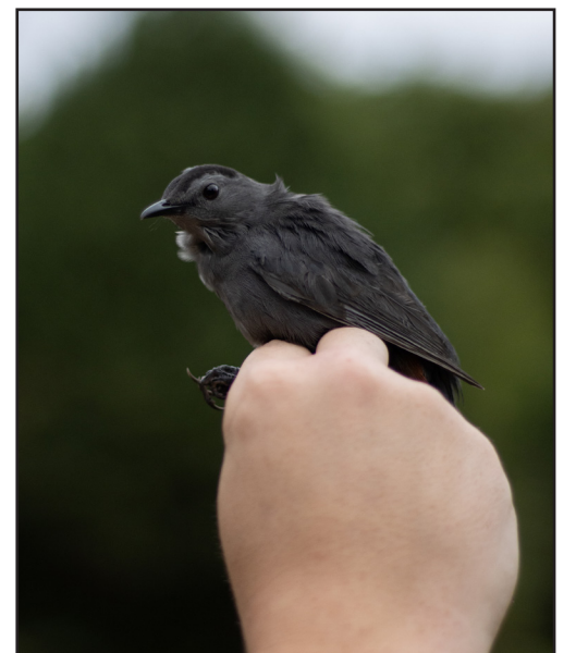
7. A wild gray catbird.