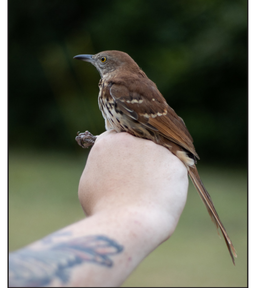
6. A wild brown thrasher.