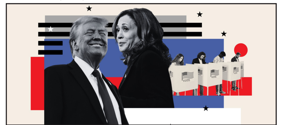
Graphic illustrating Donald Trump, Kamala Harris and voters.

Whenever voters see the president they elected take a certain stance or make a certain decision they should ask themselves: is this what I stand for?