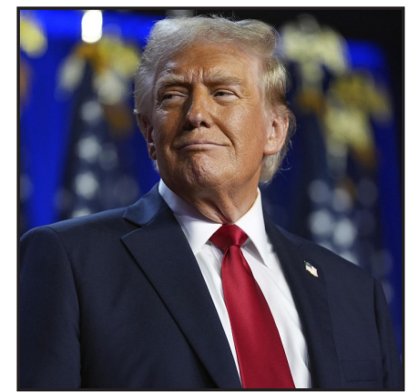
Donald Trump at the Palm Beach Convention Center on election night.

For the full article, visit our website at astatetheherald.com