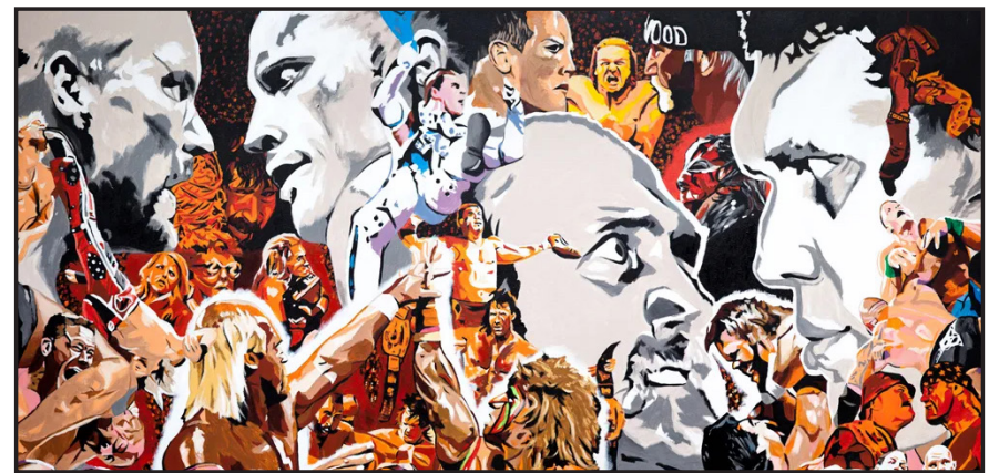
Artwork depicts a collage of professional wrestlers throughout history.

But of course, that's just one man's opinion.