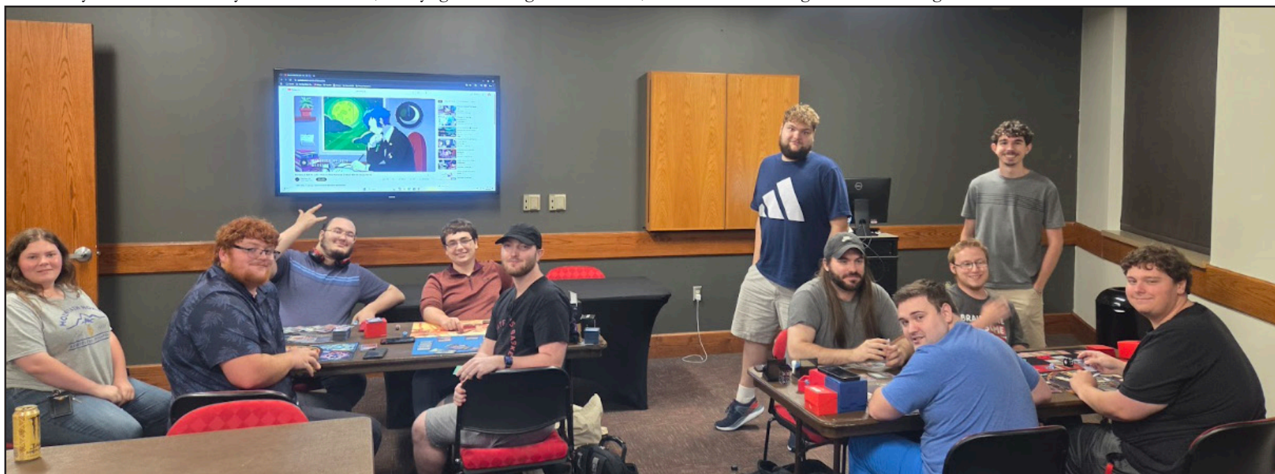
Attendees at Magic: The Gathering club's tutorial night on Thursday.